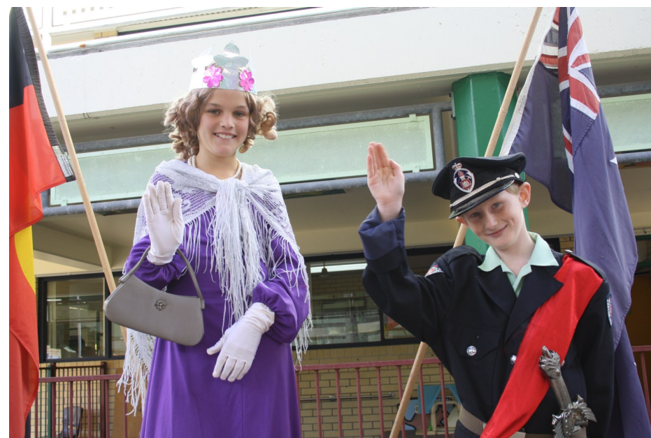
Special guests, The Queen and Prince Phillip during the "Opening Ceremony"