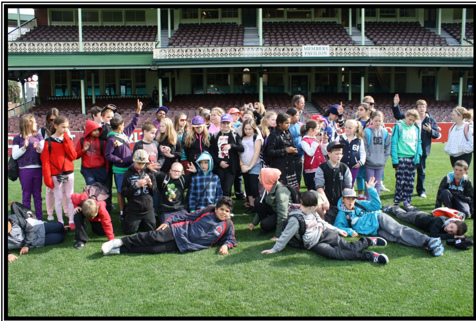
Sydney Cricket Ground