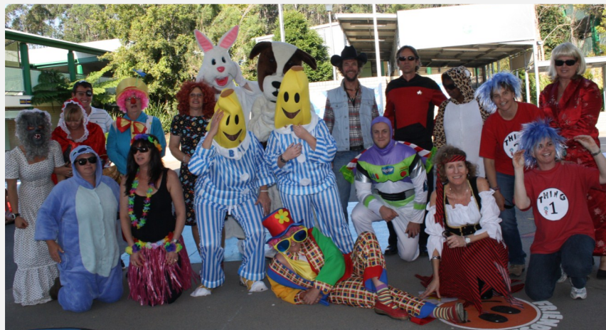
Our wonderful staff