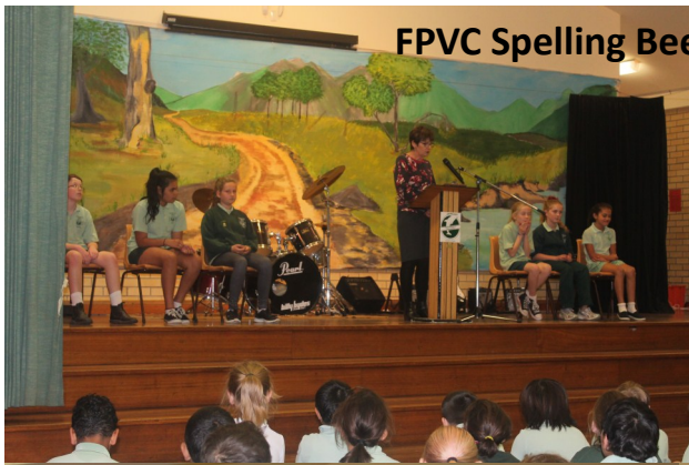
FPVC Spelling Bee