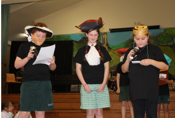
Tournament of the Minds