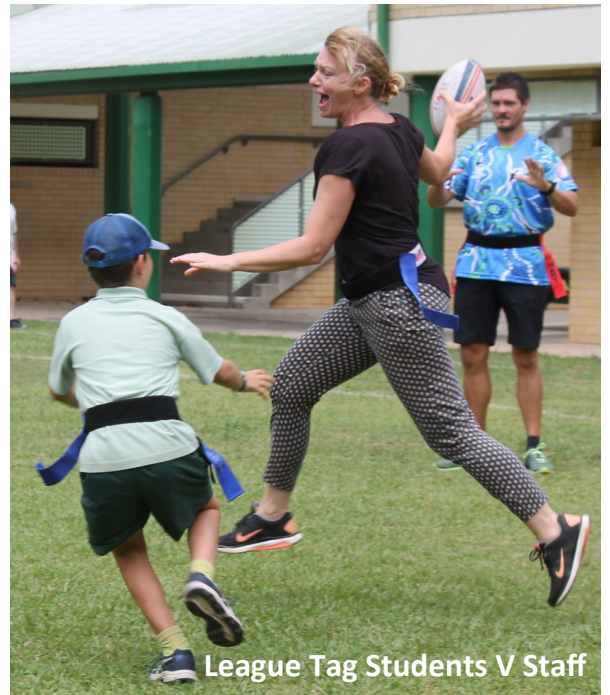
League Tag Students V Staff